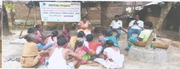
Awareness on kitchen garden