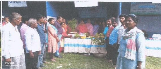
Visit on Sabola Mela