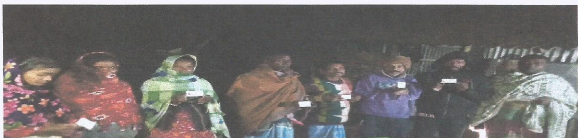
1. Distribution medicines among local people .