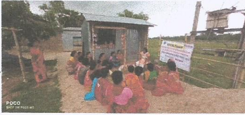
Awareness on MCH