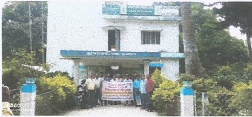
Visit on KVK Maldah