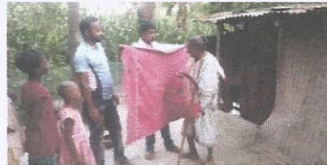
1. Distribution of Rice and wheat and cloths