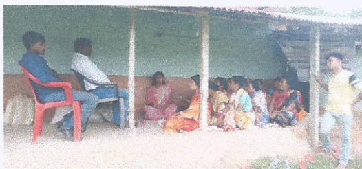
Meeting with SHGs