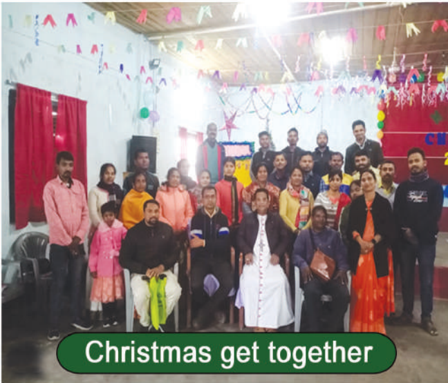
Christmas get together