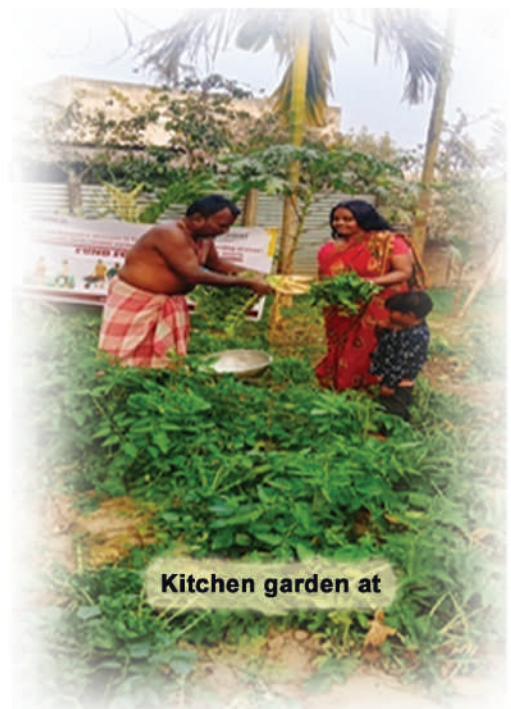
Kitchen garden at