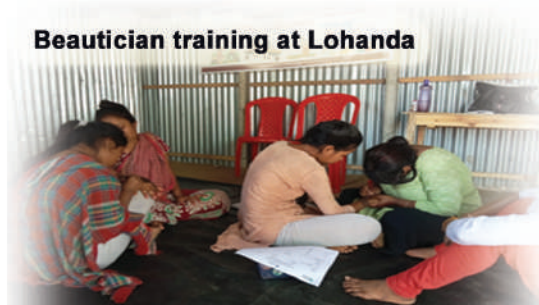
Beautician training at Lohanda