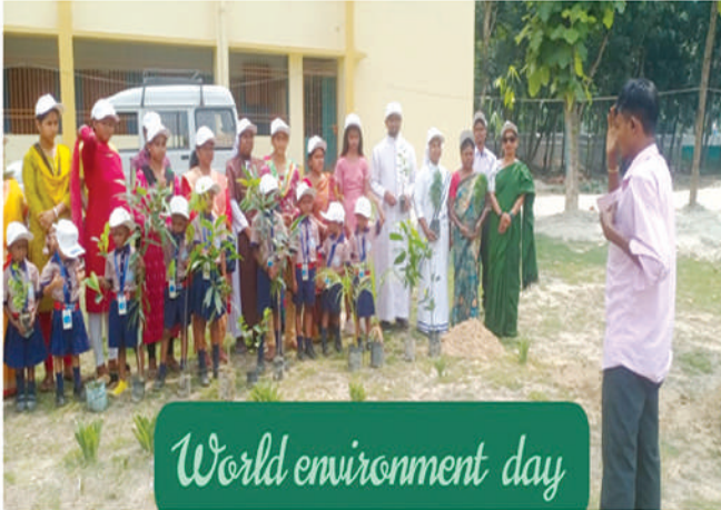
World environment day