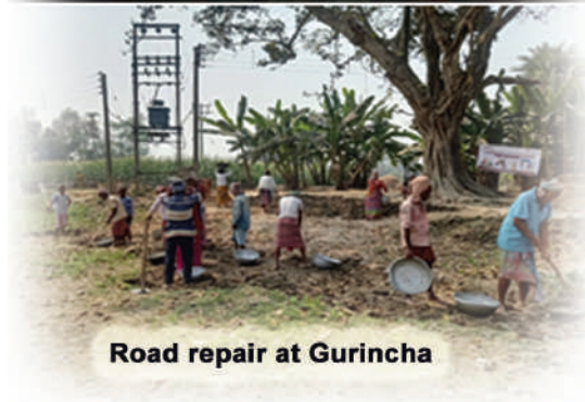
Road repair at Gurincha