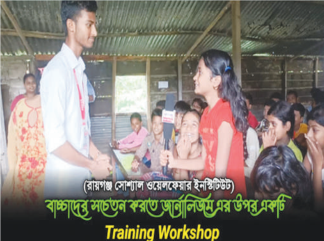
(রায়গঞ্জ সোশ্যাল ওয়েলফেয়ার ইনস্টিটিউট) বাচ্চাদের সচেতন করতে জার্নালিজম এর উপর প্রশিক্ষণ Training Workshop