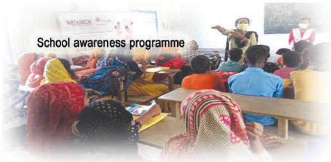
School awareness programme

1500 individuals have given up their resistance to vaccination as a result of project interventions and are fully immunized against Covid19.