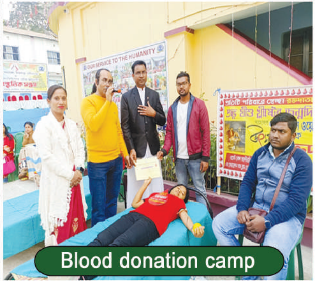
Blood donation camp