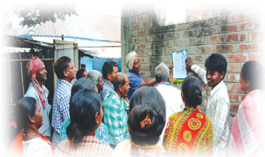
People checking the beneficiary list